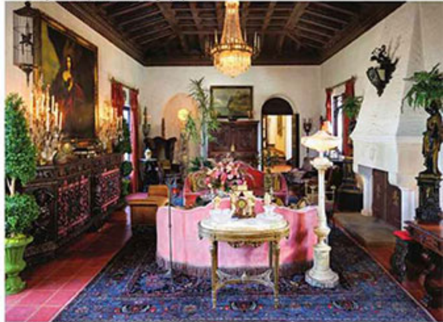
dreamhomesmagazine.com | web #186033

Reminiscent of old La Jolla, this 1927 historic landmark is one of the few true estates "in town." Designed by master architect Herbert E. Palmer this 7 bedroom, 5.5 bath home features majestic ocean views, an office, a pool, a tennis court, rolling lawns, a small orchard, and a rose garden all on almost an acre of primarily flat land. The design and detail is extraordinary throughout bringing you right back to the time period of the true Spanish Colonial estates. $12,500,000